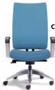
FIR4 A : 19 1/2" C : 16 3/4 - 22 1/2" E : 24 1/2"