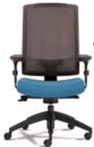
FIM3 A : 19 1/2" C : 16 3/4 - 22 1/2" E : 23 1/2"