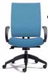
FIR3 A : 19 1/2" C : 16 3/4 - 22 1/2" E : 21 1/2"