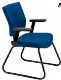
L9001 T A : 20 1/2" C : 18" E : 17"