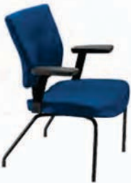
L9001 P A : 20 1/2" C : 18" E : 17"