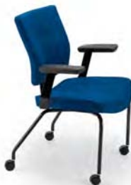
L9001 PR A : 20 1/2" C : 18" E : 17"