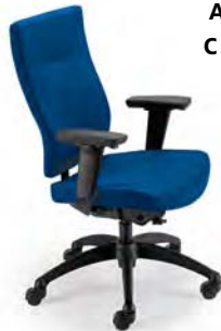
L9002 A : 20 1/2" C : 17 - 21" E : 23"