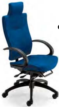
L9003 A : 20 1/2" C : 17 - 21" E : 29"