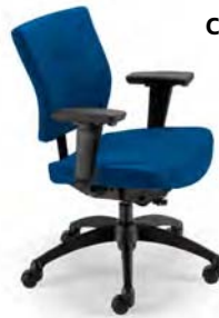
L9001 A : 20 1/2" C : 17 - 21" E : 17"