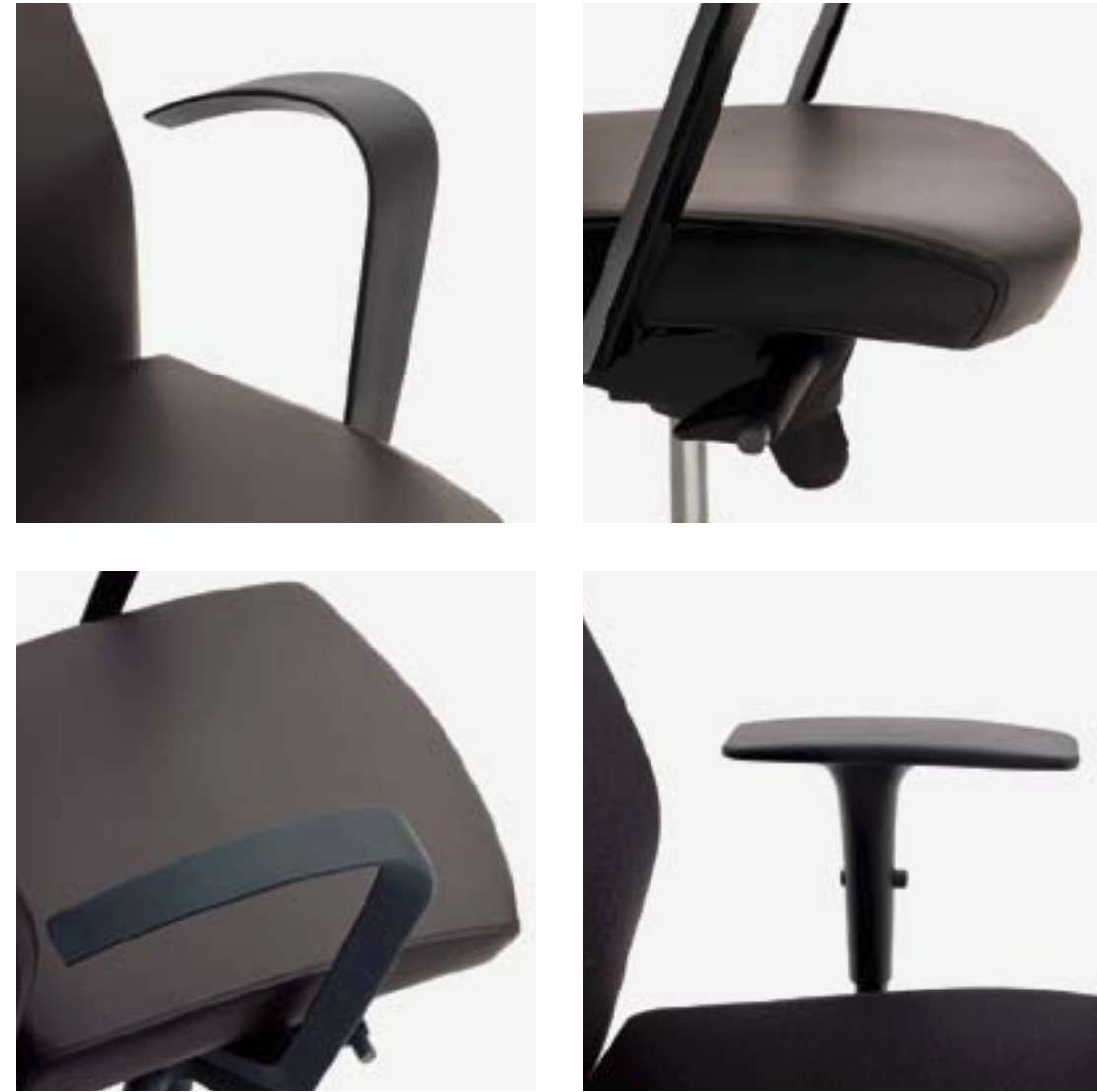
TOP LEFT: Textured plastic fixed arm; TOP RIGHT: The Synchro tilt mechanism, which provides a single lever controlling a range of tilt lock locations, an anti-kickback release, and gas lift height adjustment; BOTTOM LEFT: Seat profile with I-Mark™ Synchro tilt mechanism visible; BOTTOM RIGHT: Optional textured plastic adjustable arm.

Dorso's attractive, contemporary look is carried over to an extensive range of guest seating: 4-legged, cantilevered, and on casters. Guest seating can also be ganged, to allow for multi-functional applications. And Dorso also includes the broad S Line offering, designed for the management level. Please consult Dorso S Line and Dorso Guest Seating brochures for additional information.