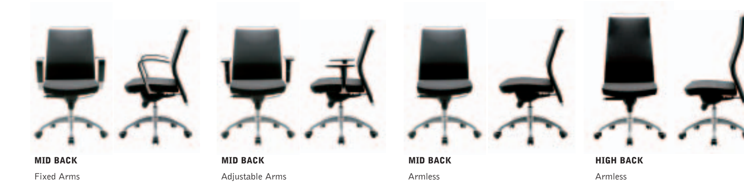
MID BACK Fixed Arms | MID BACK Adjustable Arms | MID BACK Armless | HIGH BACK Armless