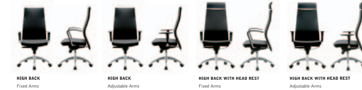
HIGH BACK Fixed Arms | HIGH BACK Adjustable Arms | HIGH BACK WITH HEAD REST Fixed Arms | HIGH BACK WITH HEAD REST Adjustable Arms