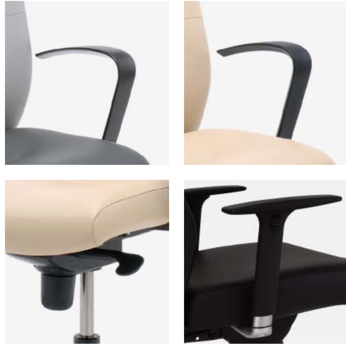
TOP LEFT: Aluminum cantilevered arm with a black plastic cap; TOP RIGHT: Cantilevered arm in black textured plastic; BOTTOM LEFT: A new synchro-tilt mechanism allows for motion that is supportive to the back and yet comfortable for the seat and legs. Its intuitive controls allow easy adjustment and operation; BOTTOM RIGHT: Adjustable arms feature seven height adjustment positions, with a total adjustment range of 2.75" and an articulation of 30 degrees.