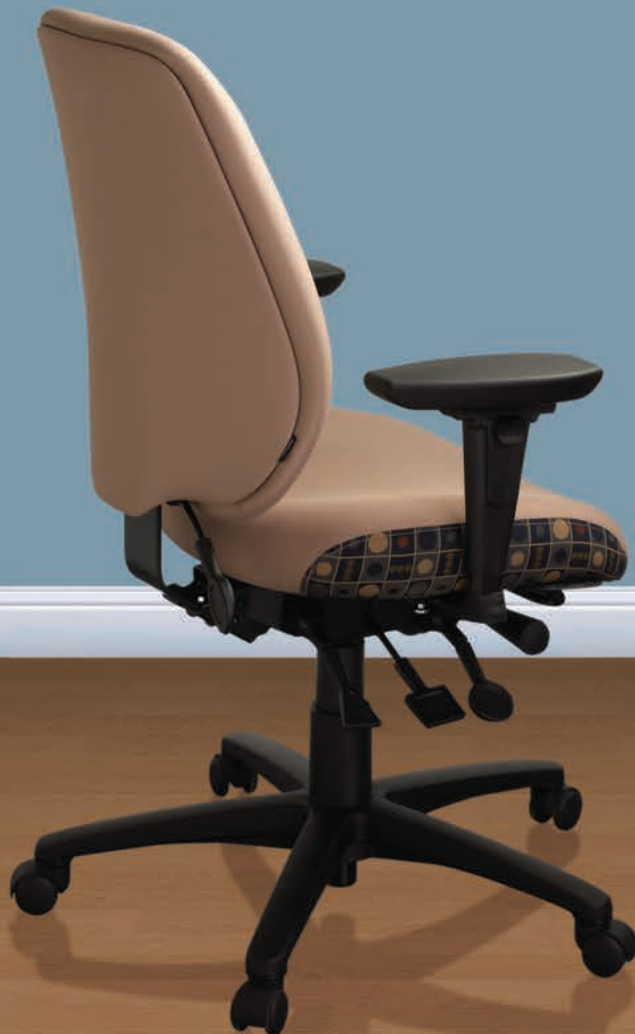
ergoCentric Tall Back