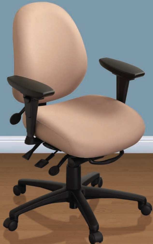
geoCentric Mid Back