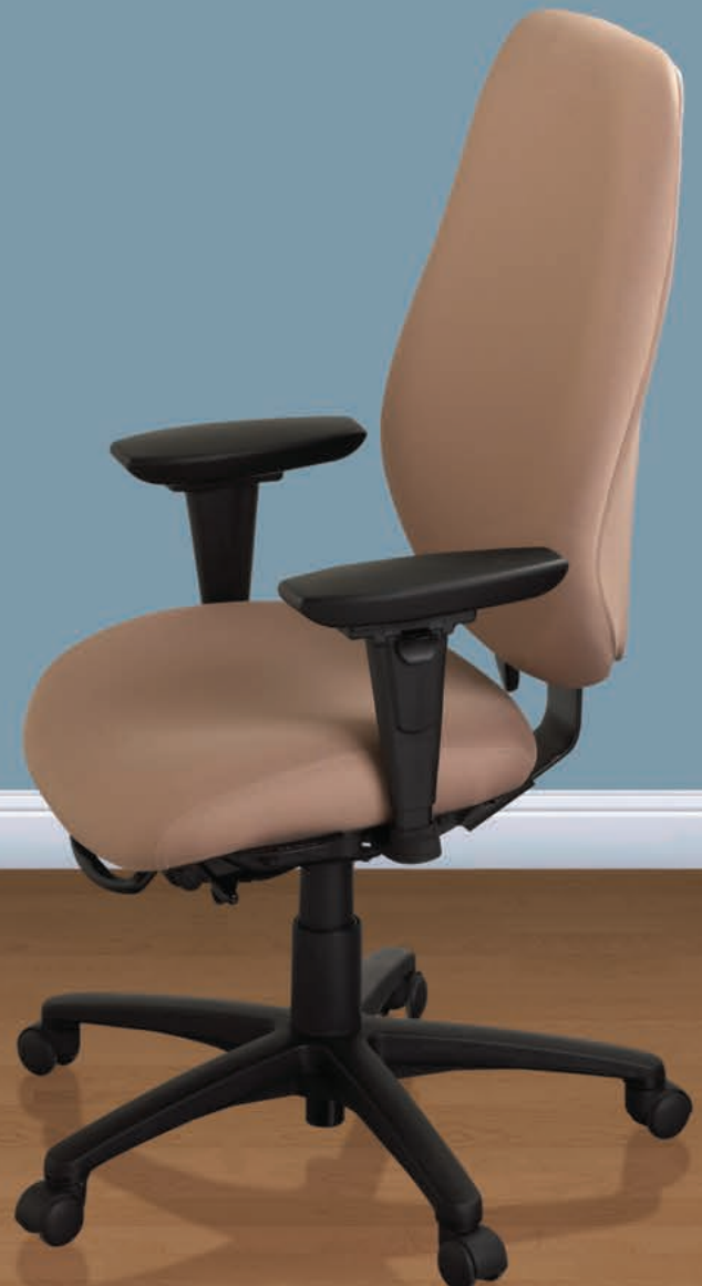
ergoCentric Extra Tall Back