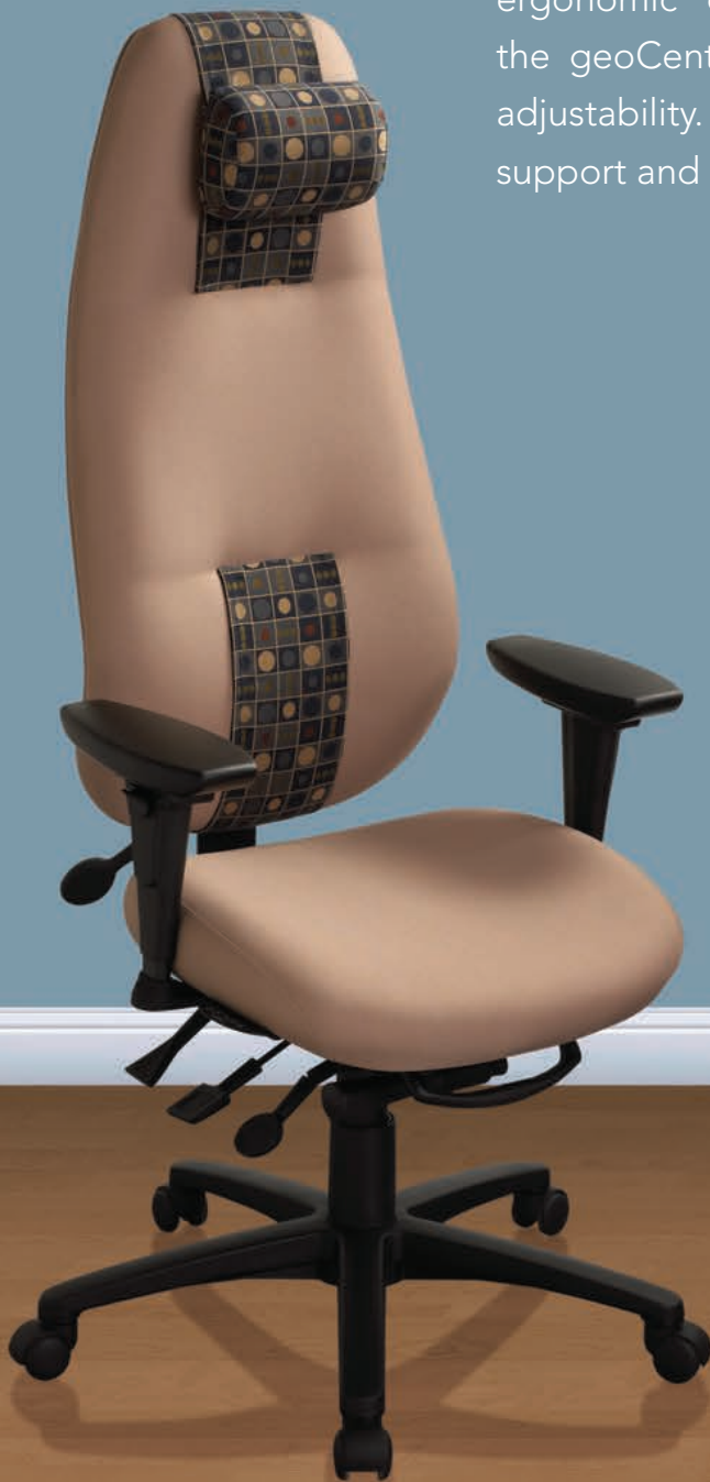
geoCentric Extra High Back

geoCentric chairs provide a comfortable solution for both dedicated and multiple office tasks requirements. Utilizing over 20 years of proven ergonomic design and patented technologies, the geoCentric series offers the widest range of adjustability. The Chairs can also be customized for support and for changing individual needs.